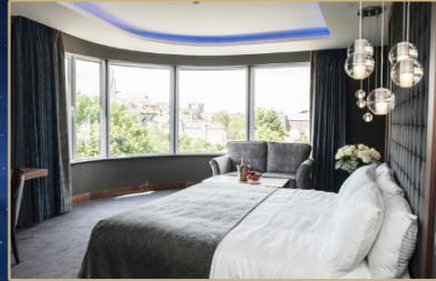
Luxurious Bedrooms Couples Deluxe Rooms Junior Suites | Balcony Rooms Leisure Club & Pool