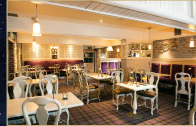
Alamo Steakhouse Open 7 Days a Week with Al á Carte Menu